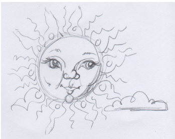
Envelope Art by Candice Westberg