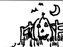
Envelope Art by Willy Gibbonney

October 22 - Market-Wide Sale October 22 - UO vs. UCLA October 29 - Halloween Market Nov. 5 - Día de Los Muertos Mercado/ Closing Day