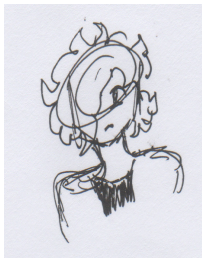
Envelope Art by Silver Lee-Hutson