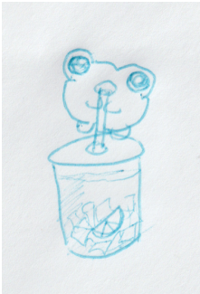
Envelope Art by: Fairiberri