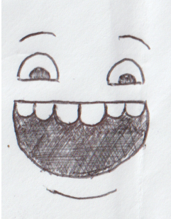
Envelope Art by: Samson L'Orange