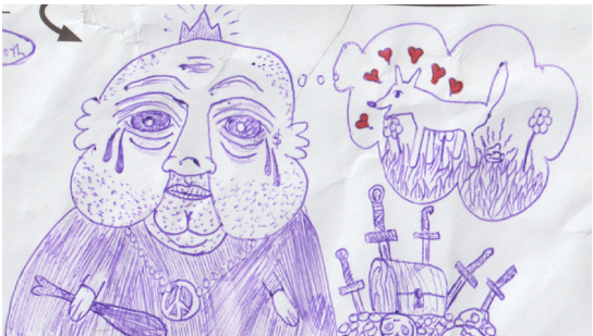
Envelope Art by: Kyle Wickham