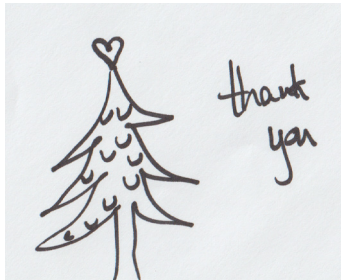
Envelope Art by: Emily Bellehumeur