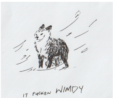
Envelope Art by: Dandelion Kalandir

June 30-July 16 - Oregon Bach Festival July 16 - Oregon Geo Fest July 19-23 - Lane County Fair July 20 - Corvallis Celtic Festival