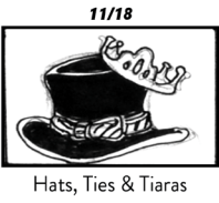
Hats, Ties & Tiaras