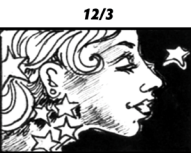
All That Glitters