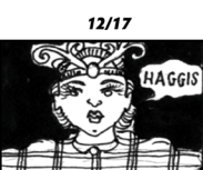
Mad for Plaid