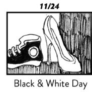
Black & White Day