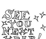
SEE YOU NEXT YEAR!