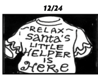
Ugly Sweater/PJs Day