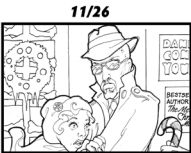
Flappers & Fedoras