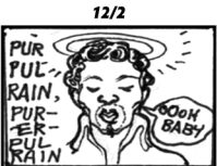
Passion for Purple