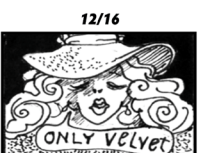
Velvet & Lace