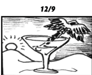
Holidaze in the Tropics