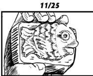
All Things Ocean